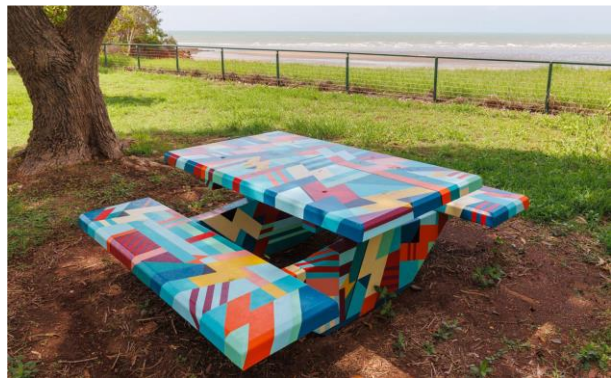
Near Gun Turret